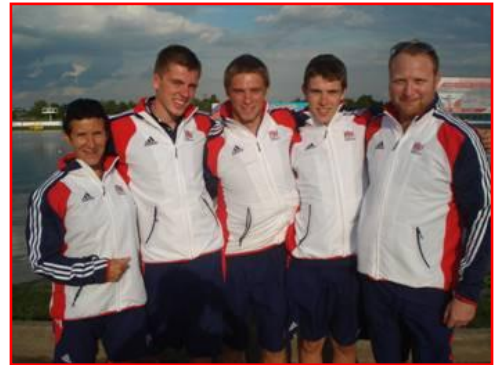
Junior World Championships Moscow 2009